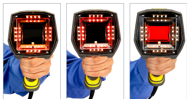
30-, 45-, and 90-degree lighting